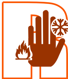
HOT & COLD SPOTS